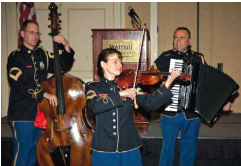
Entertainment for the CINC Award Luncheon was the Army Band's Strolling Strings performing a medley of songs.

Base Camp Briefs is the quarterly newsletter of the George Washington and Fairfax-Lee Chapters of the Association of the United States Army. It is published by Silver Communications, a private firm in no way connected with the Department of the Army. Opinions expressed herein are those of the authors and are not to be considered an official expression of the Department of the Army. The appearance of advertisements in this publication, to include all inserts and supplements, does not constitute an endorsement by the Department of the Army of the products or services advertised.